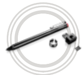
Lenovo Active Pen