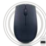
Lenovo 520 Wireless Mouse