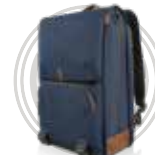
Lenovo 15.6" Laptop Urban Backpack B810