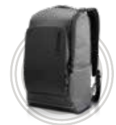
Lenovo Legion 15.6" Recon Gaming Backpack

* Example of Lenovo Legion catalogue naming convention