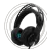
Lenovo Legion H300 Stereo Gaming Headset