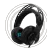
Legion H300 Stereo Gaming Headset