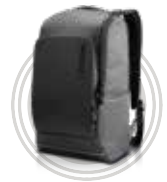
Lenovo Legion 15.6" Recon Gaming Backpack

* Example of Lenovo Legion catalogue naming convention