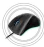
Lenovo Legion M500 RGB Gaming Mouse