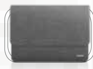
Lenovo Ultra Slim Sleeve

* Example of Lenovo IdeaPad catalogue naming convention