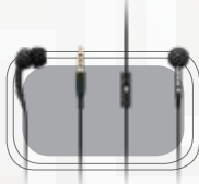
Lenovo 100 In-Ear Headphone