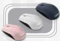
Lenovo 520 Wireless Mouse