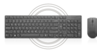
Lenovo Professional Ultraslim Wireless Combo

* Example of Lenovo IdeaCentre AIO catalogue naming convention