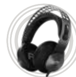
Lenovo Legion H500 Pro 7.1 Surround Sound Gaming Headset