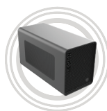
Lenovo Legion BoostStation