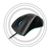
Lenovo Legion M500 RGB Gaming Mouse

* Example of Lenovo Legion catalogue naming convention