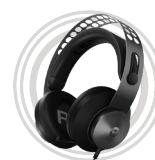
Lenovo Legion H500 Pro 7.1 Surround Sound Gaming Headset