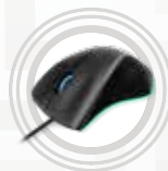
Lenovo Legion M500 RGB Gaming Mouse