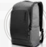
Lenovo Legion 15.6" Recon Gaming Backpack