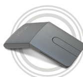
Lenovo Yoga Mouse with Laser Presenter