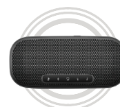
Ultraportable Bluetooth® Speaker

* Example of Lenovo Yoga Duet catalogue naming convention