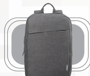
Lenovo 15.6" Laptop Casual Backpack B210