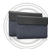
Lenovo Yoga Sleeves (14" and 15")

* Example of Lenovo catalogue naming convention