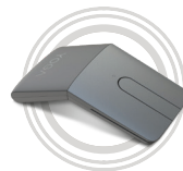
Lenovo Yoga Mouse with Laser Presenter