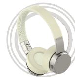
Lenovo Yoga Active Noise-cancellation Headphones