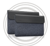
Lenovo Yoga Sleeves (14" and 15")

* Example of Lenovo catalogue naming convention