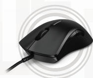
Lenovo Legion M300 RGB Gaming Mouse