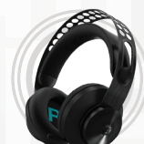
Lenovo Legion H300 Stereo Gaming Headset