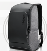
Lenovo Legion 15.6" Recon Gaming Backpack

* Example of Lenovo catalogue naming convention