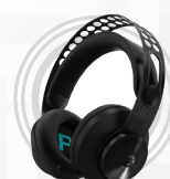
Legion H300 Stereo Gaming Headset