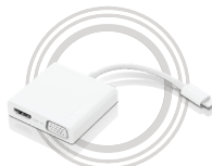
Lenovo USB-C 3-in-1 Hub