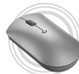
Lenovo 600 Bluetooth® Silent Mouse