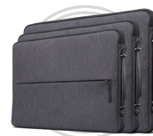
Lenovo Urban Sleeve Case 13"