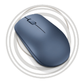
Lenovo 530 Wireless Mouse