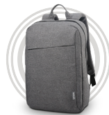
Lenovo 15.6" Casual Backpack B210