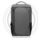
Lenovo 15.6" Laptop Urban Backpack B530