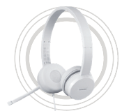
Lenovo 110 USB Stereo Headset