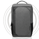
Lenovo 15.6" Laptop Urban Backpack B530