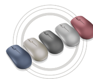
Lenovo 530 Wireless Mouse