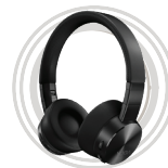
Lenovo Yoga ANC Headphone