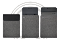
Yoga 9i Keyboard Cover