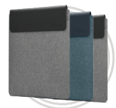
Lenovo Yoga Sleeve