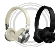
Lenovo Yoga Active Noise Cancellation Headphones